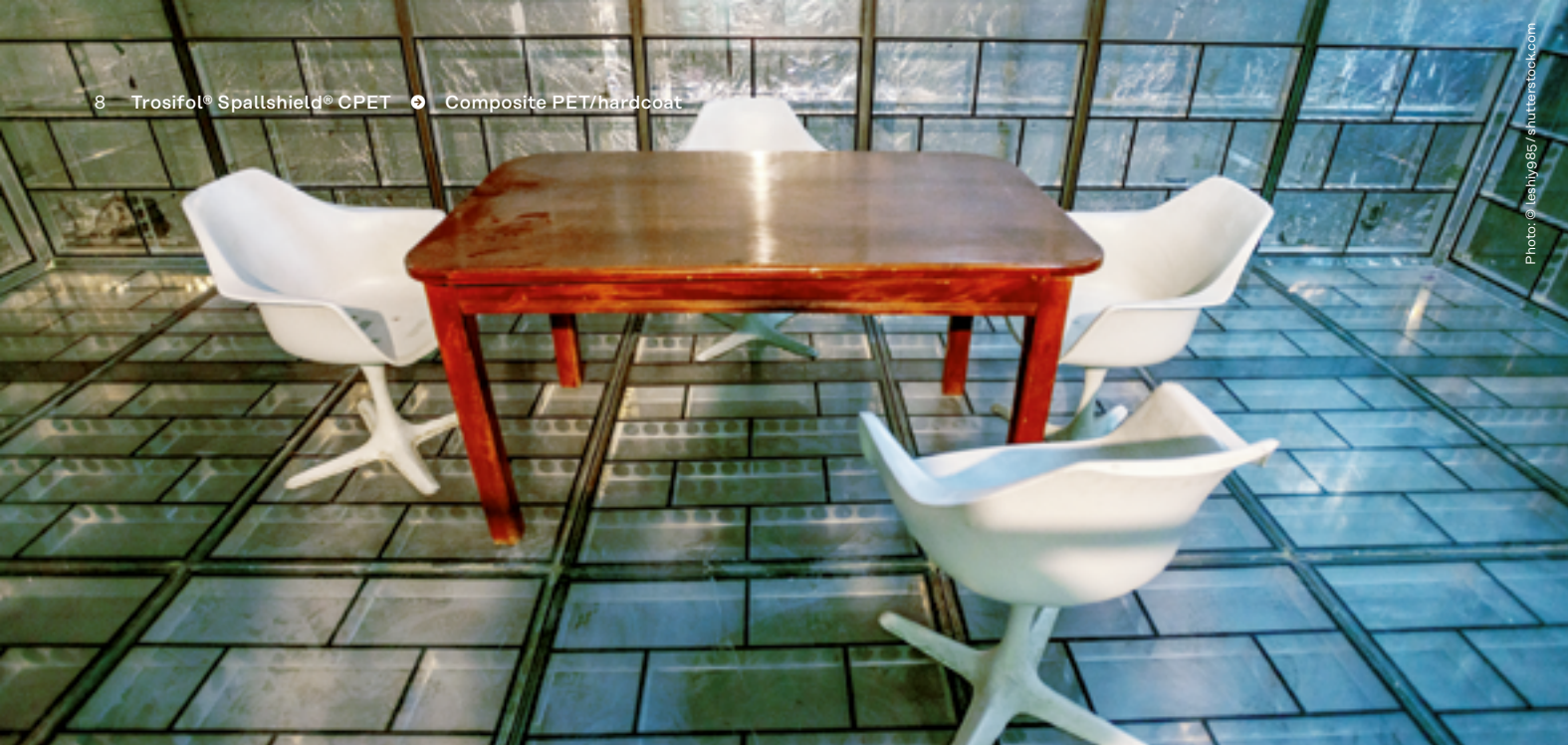
• Glass room in former US Embassy