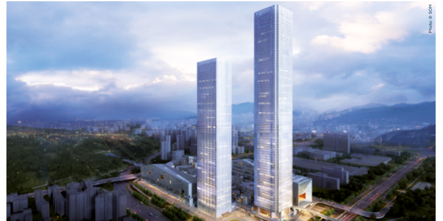
• SHUM YIP UpperHills LOFT, Shenzhen, China