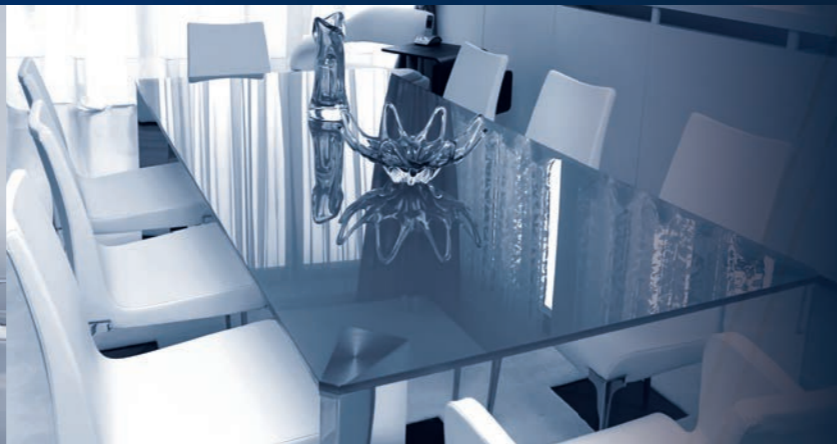
mirrors | showers | photovoltaic systems | tables