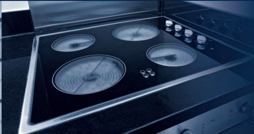
doors | structural facades and windows | ovens and cooktops