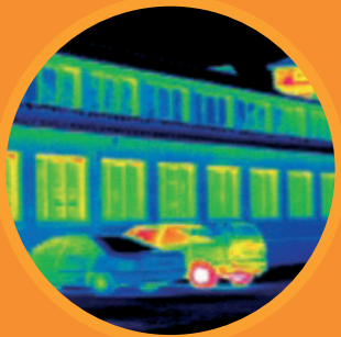
Warm Edge Windows showing virtually no heat loss.